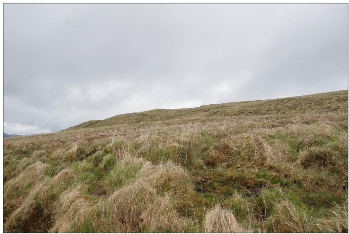
Plate 14.16 General view towards location of T7 from southeast