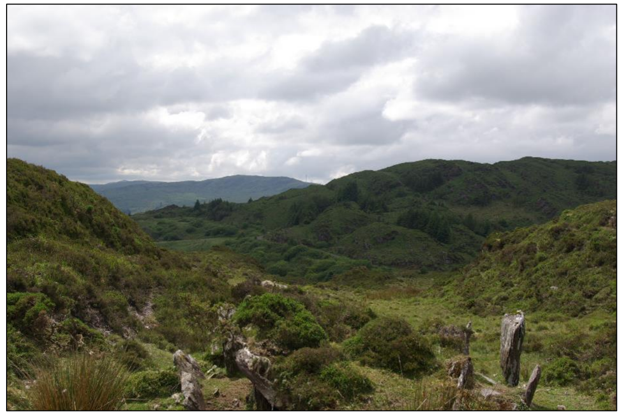
Plate 14.2 View from east of alignment view of Wedge tomb C069-093---- towards west