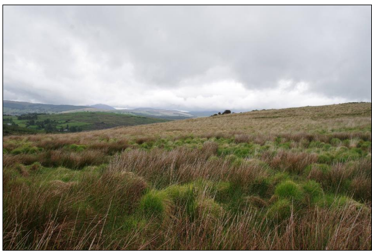
Plate 14.17 General view towards location of T8 from south