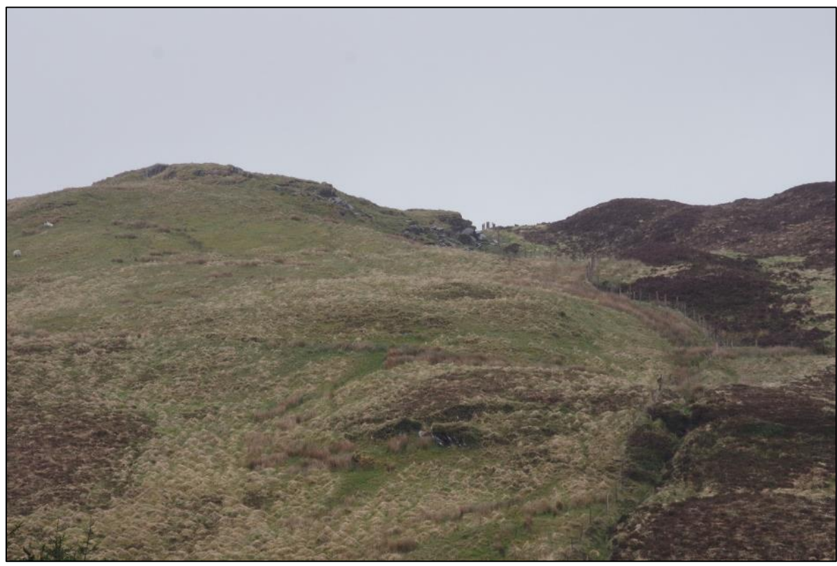
Plate 14.10 General view towards location of T1 from south