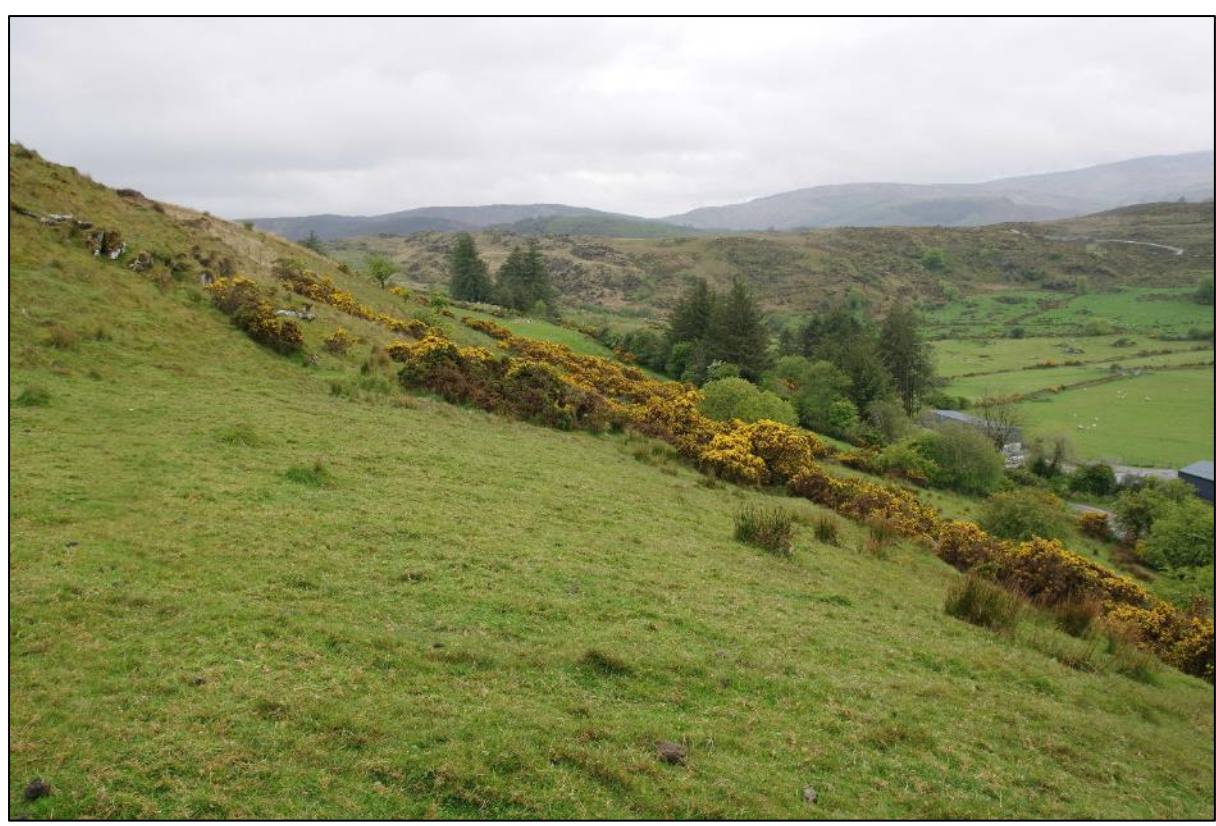
Plate 14.21 General view towards location of T12 from east