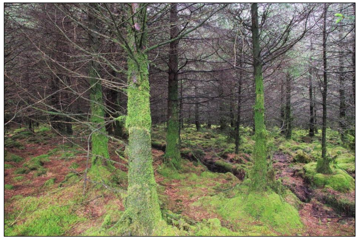
Plate 14.14 View from north of ground surface within plantation containing proposed locations of T4 and T5