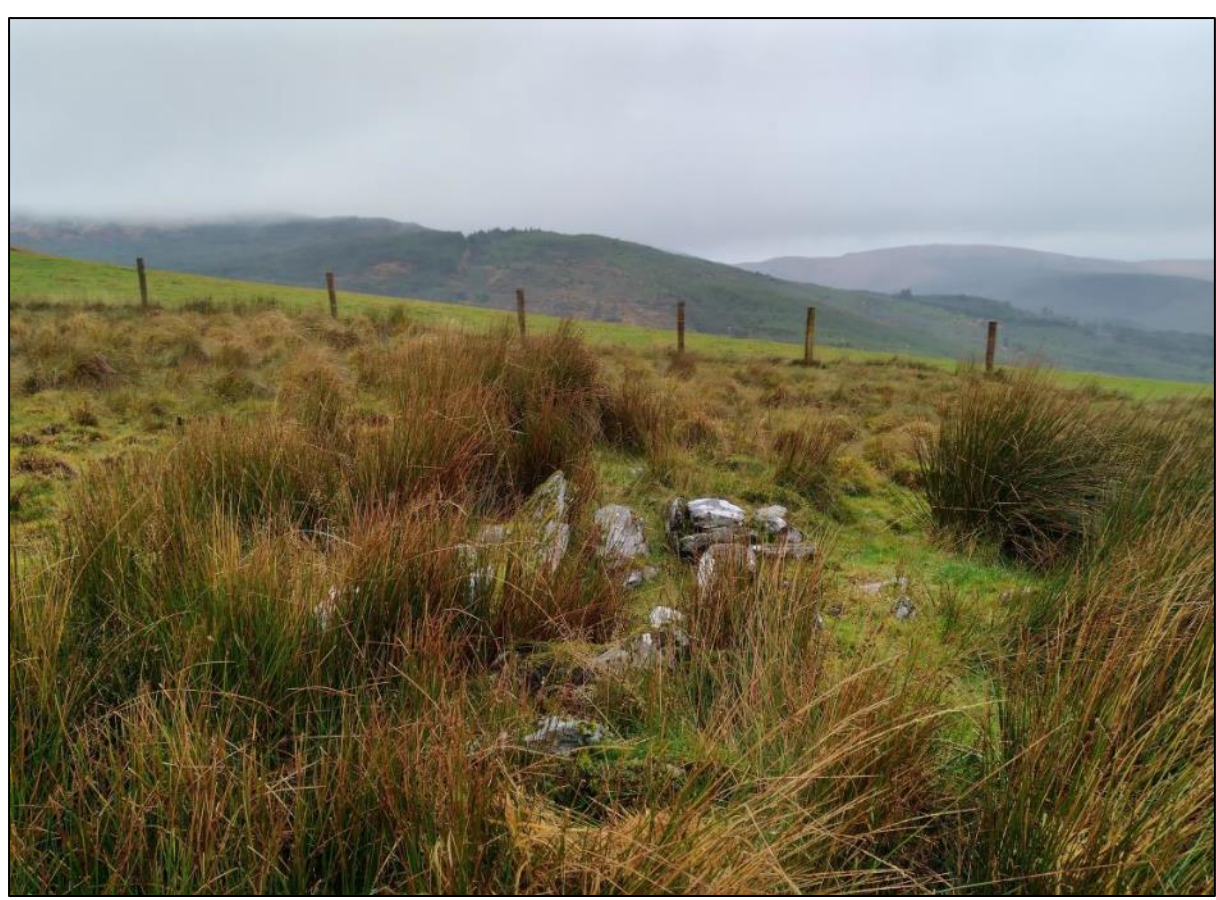
Plate 14.3 View of remains of Wedge tomb C069-003---- facing west-southwest