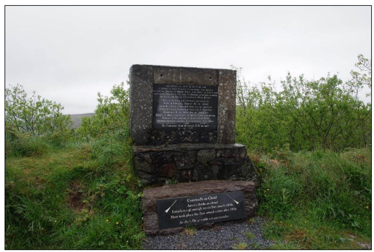
Plate 14.9 Memorial Plaque at roadside to south of the Site