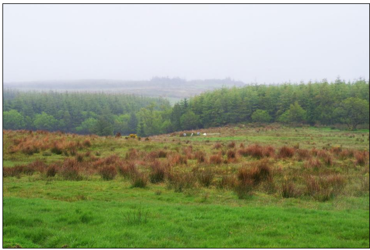
Plate 14.8 View from west towards Radial Cairn CO069-040---- (indicated with arrow) in lands outside east end of Site