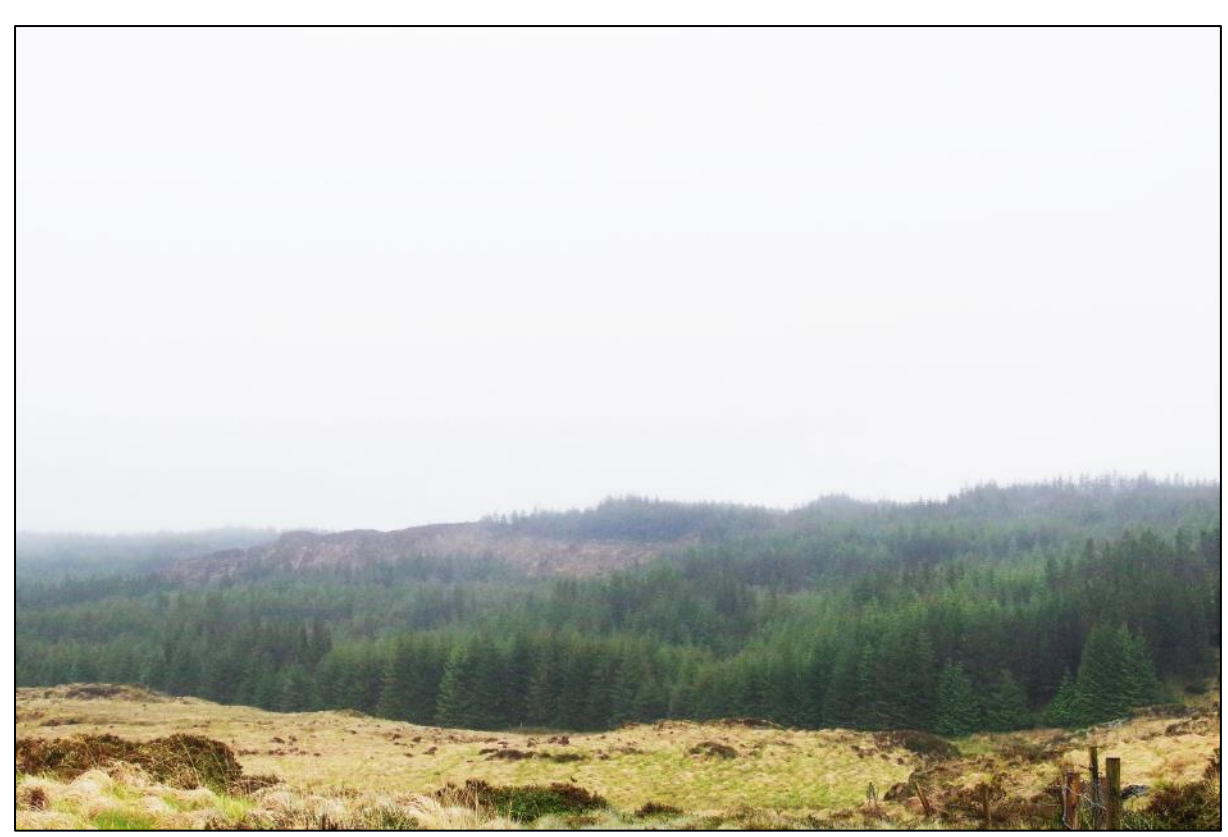
Plate 14.13 General view from north of upland forestry containing proposed locations of T4 and T5