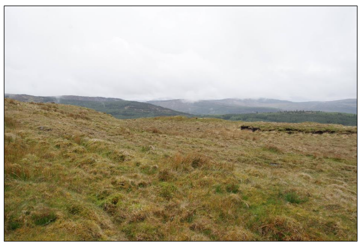
Plate 14.11 General view towards location of T2 from east