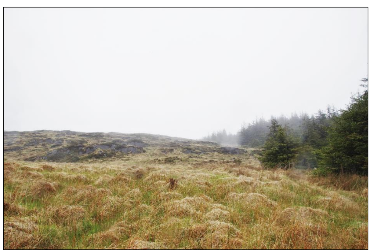
Plate 14.19 General view towards location of T10 from south