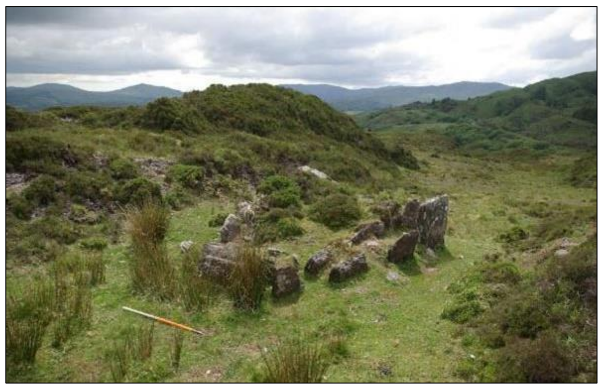
Plate 14.1 View of Wedge tomb C069-093 from northeast