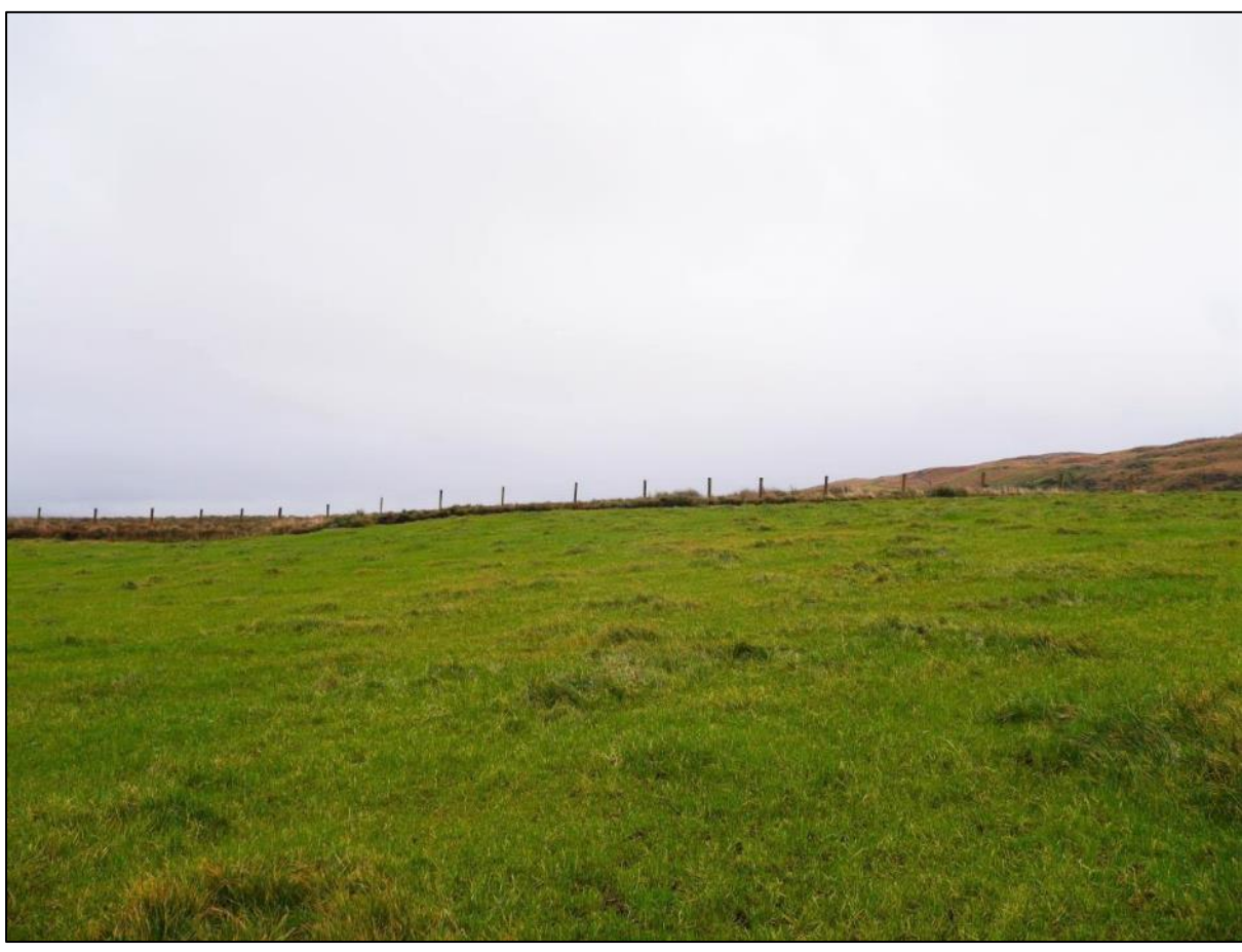
Plate 14.18 View of improved grassland at location of T9 from west, with no traces of field boundary CO069-070---- visible in area