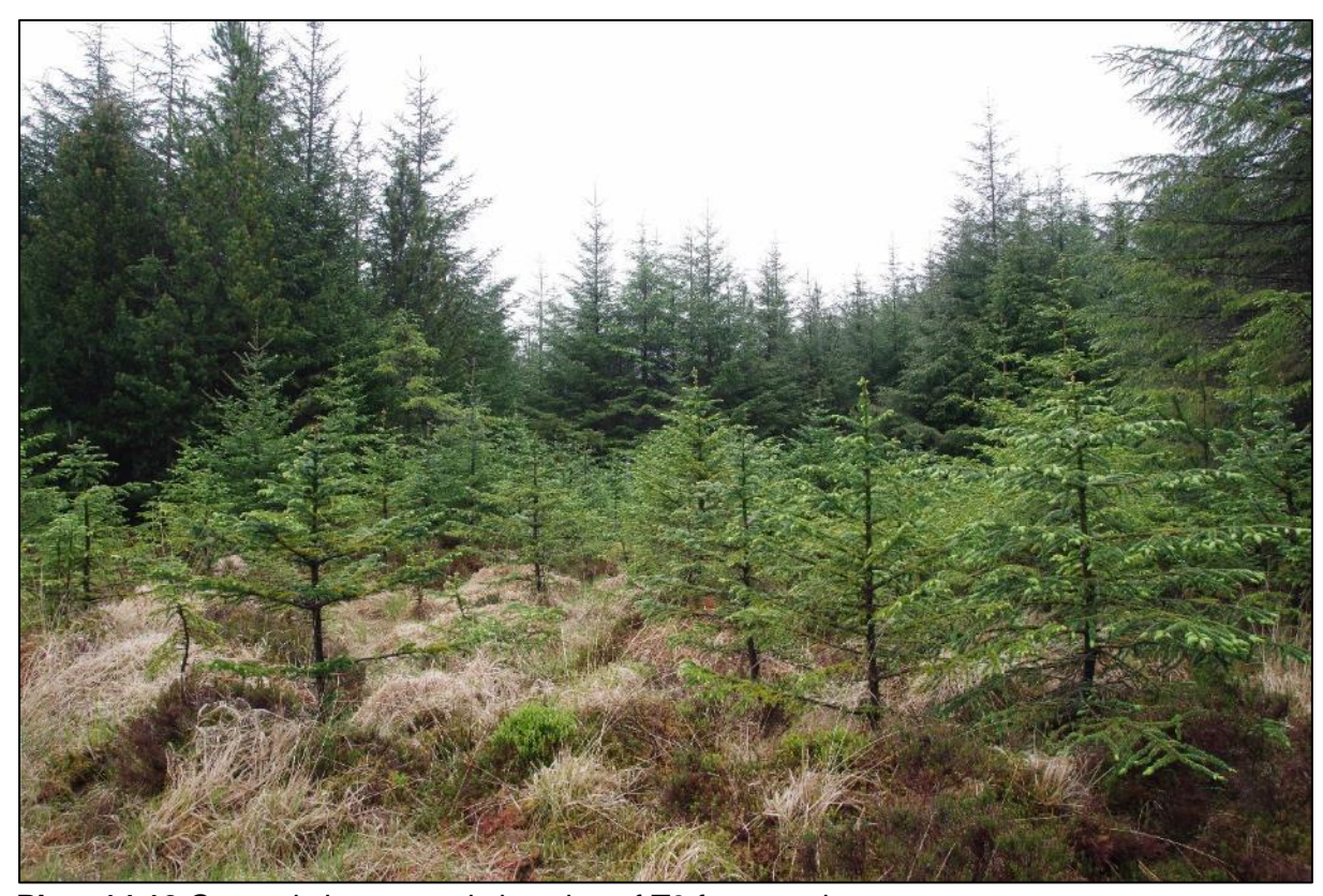
Plate 14.12 General view towards location of T3 from north