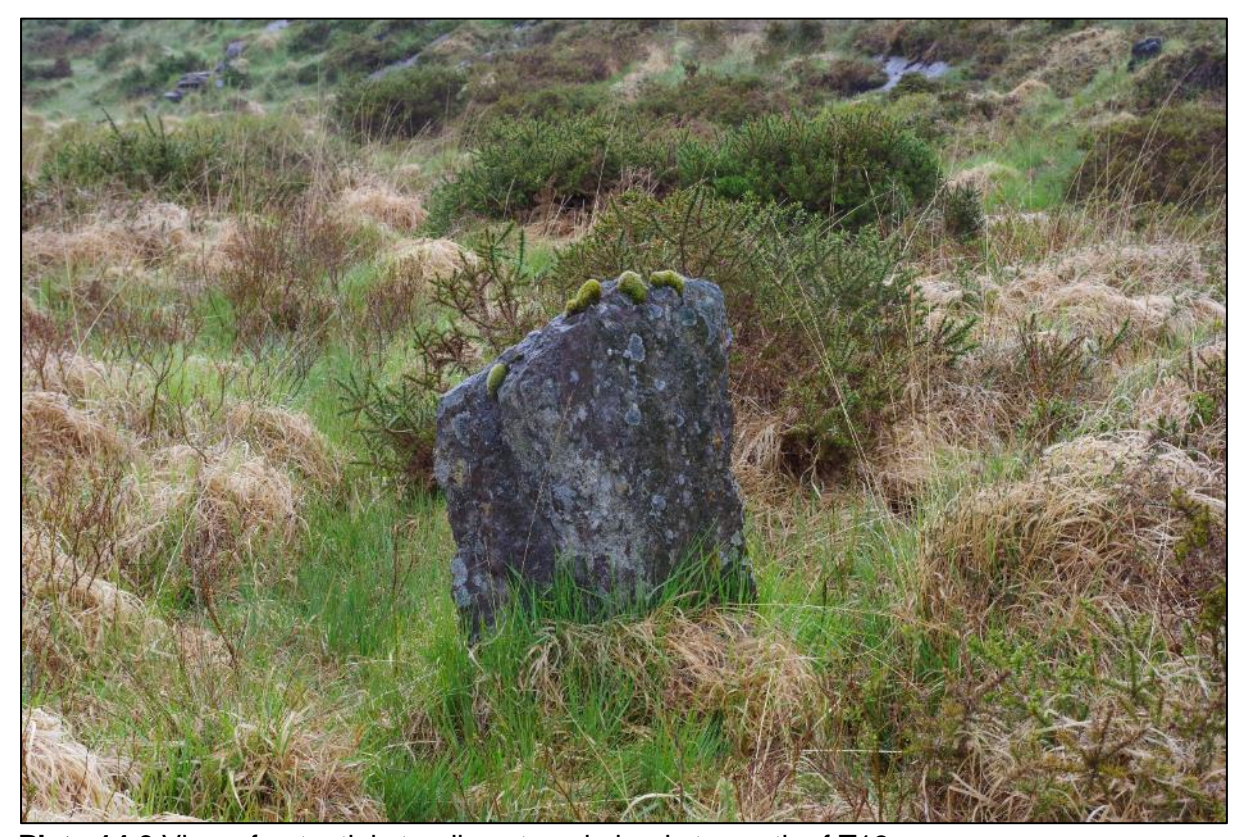
Plate 14.6 View of potential standing stone in lands to south of T13