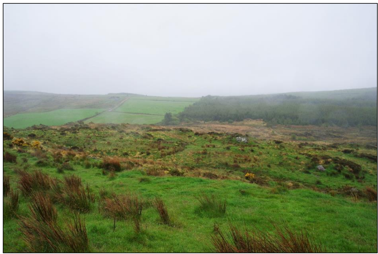
Plate 14.22 General view towards location of T13 from east