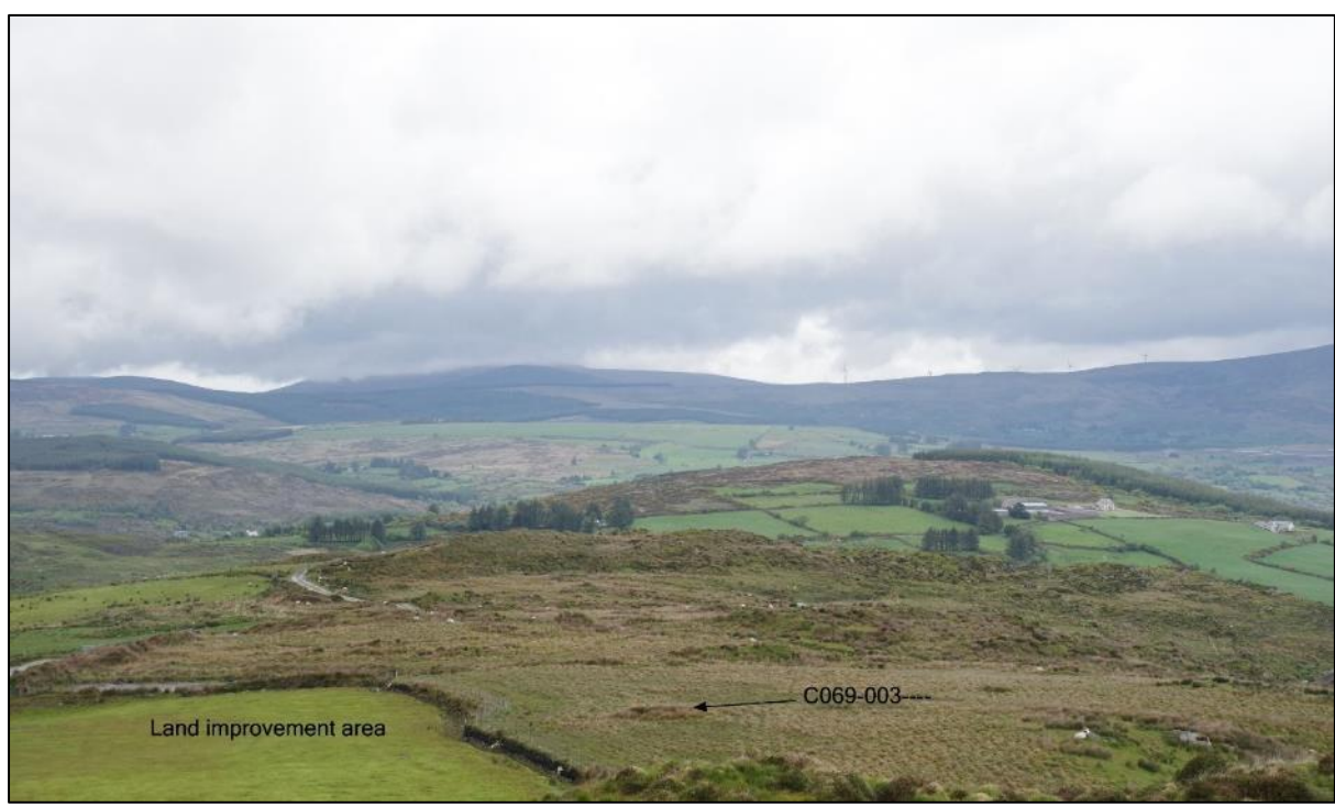
Plate 14.4 General view from south towards location of wedge tomb CO069-003---- showing extent of recent land improvement works in area to west. No trace of field boundary CO069-070---- noted in area