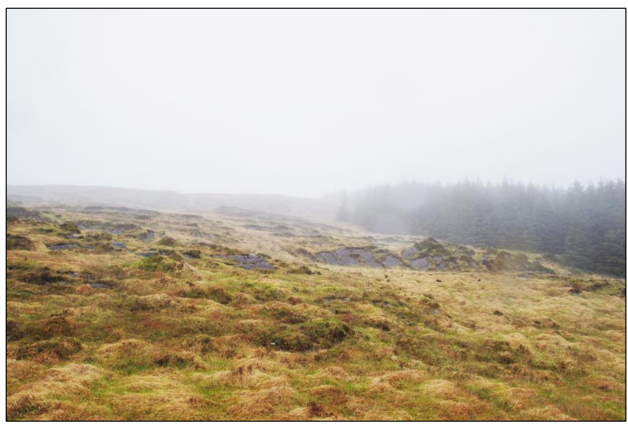
Plate 14.15 General view towards location of T6 from south