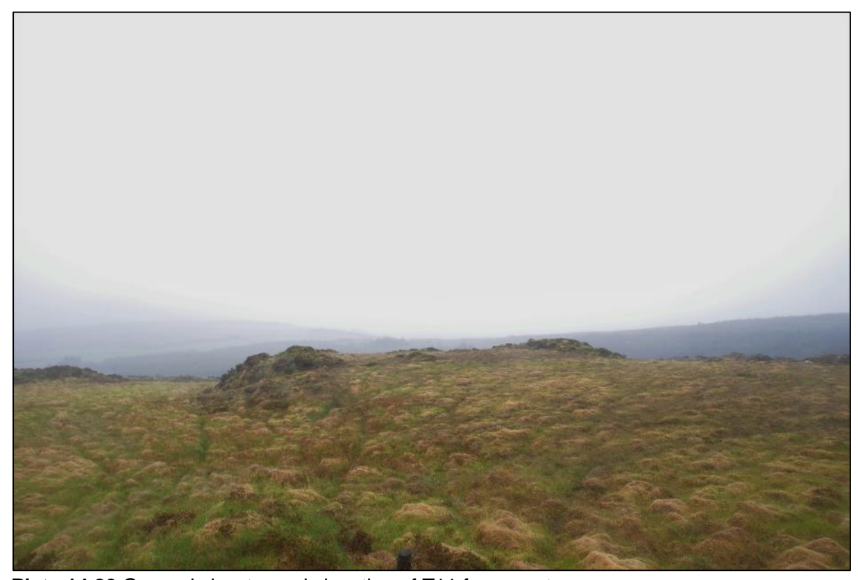
Plate 14.20 General view towards location of T11 from west