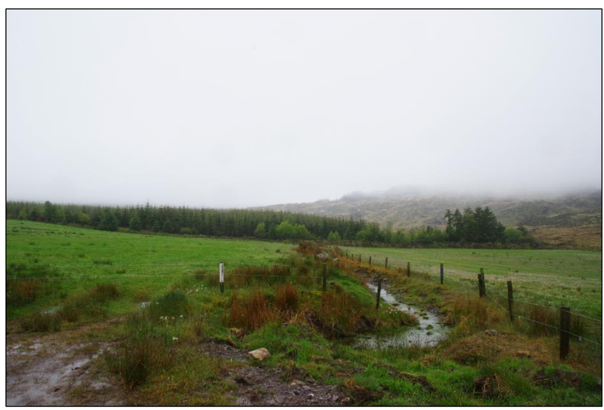
Plate 14.23 General view towards improved grassland at location of T14 from east