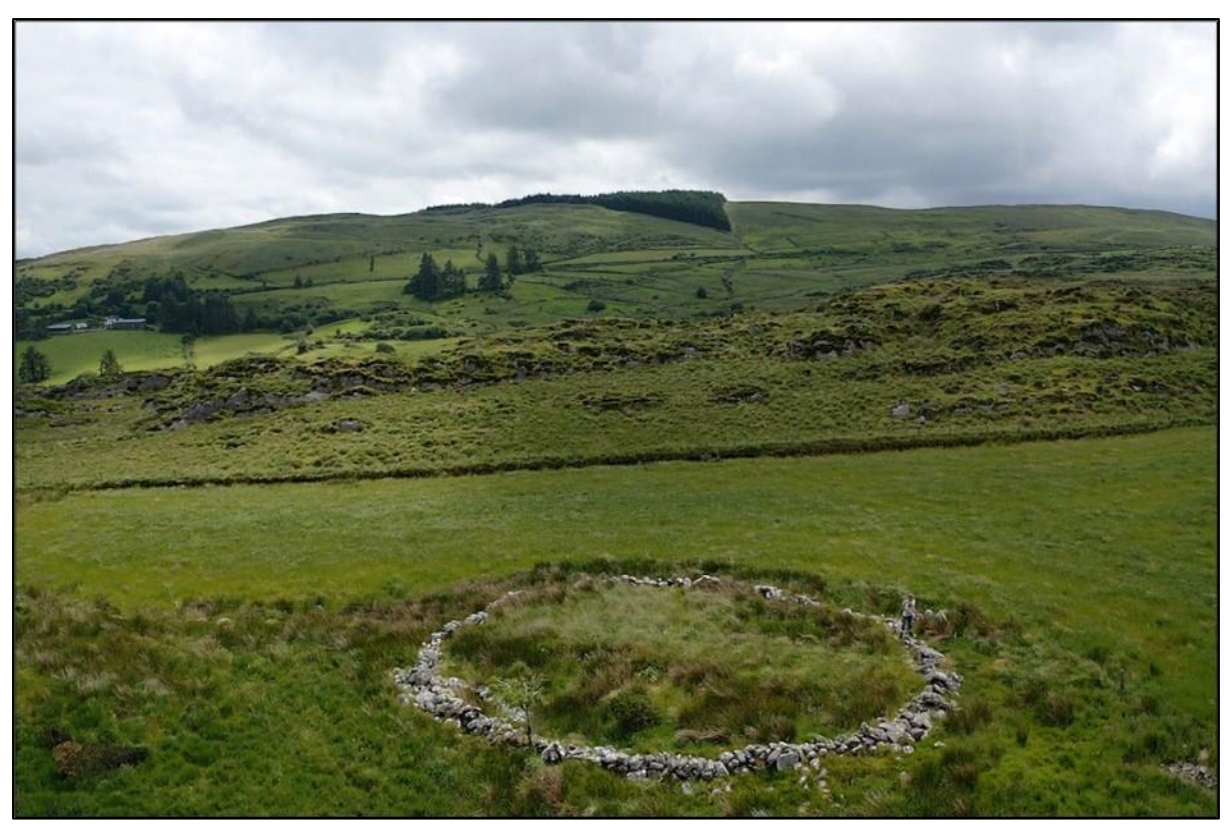
Plate 14.5 Drone view of Enclosure CO069-002---- from north with proposed location of substation on ridgeline to south